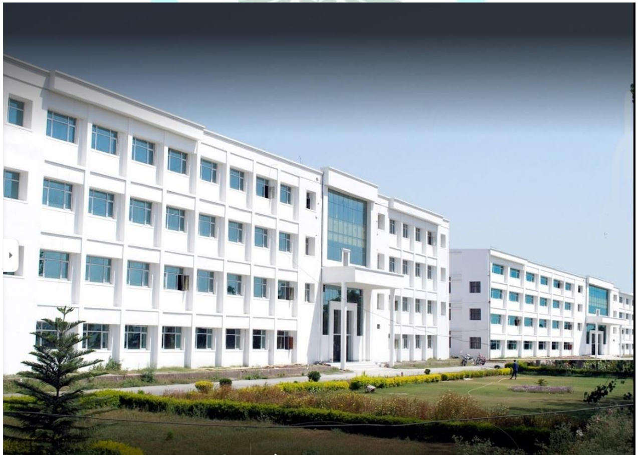
Himachal Institute of Dental Sciences, Paonta Sahib, Himachal Pradesh