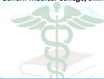
A VIEW Indra Gandhi Medical College, Shimla