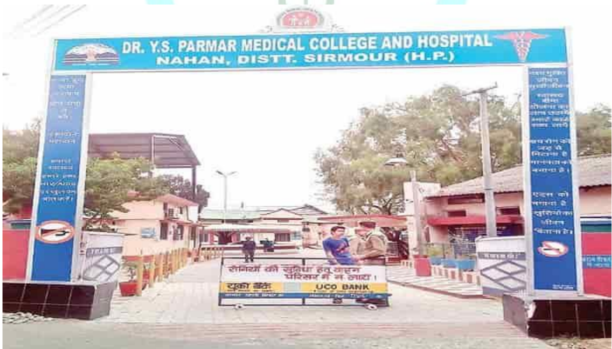
Dr. Y. P. Parmar Govt. Medical College, Nahan