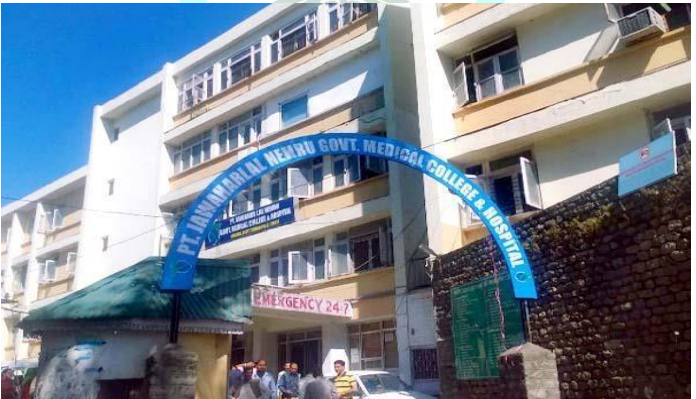
Jawahar Lal Nehru Govt. Medical College, Chamba