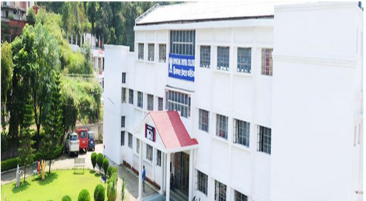
Himachal Dental College, Sunder Nagar, HP