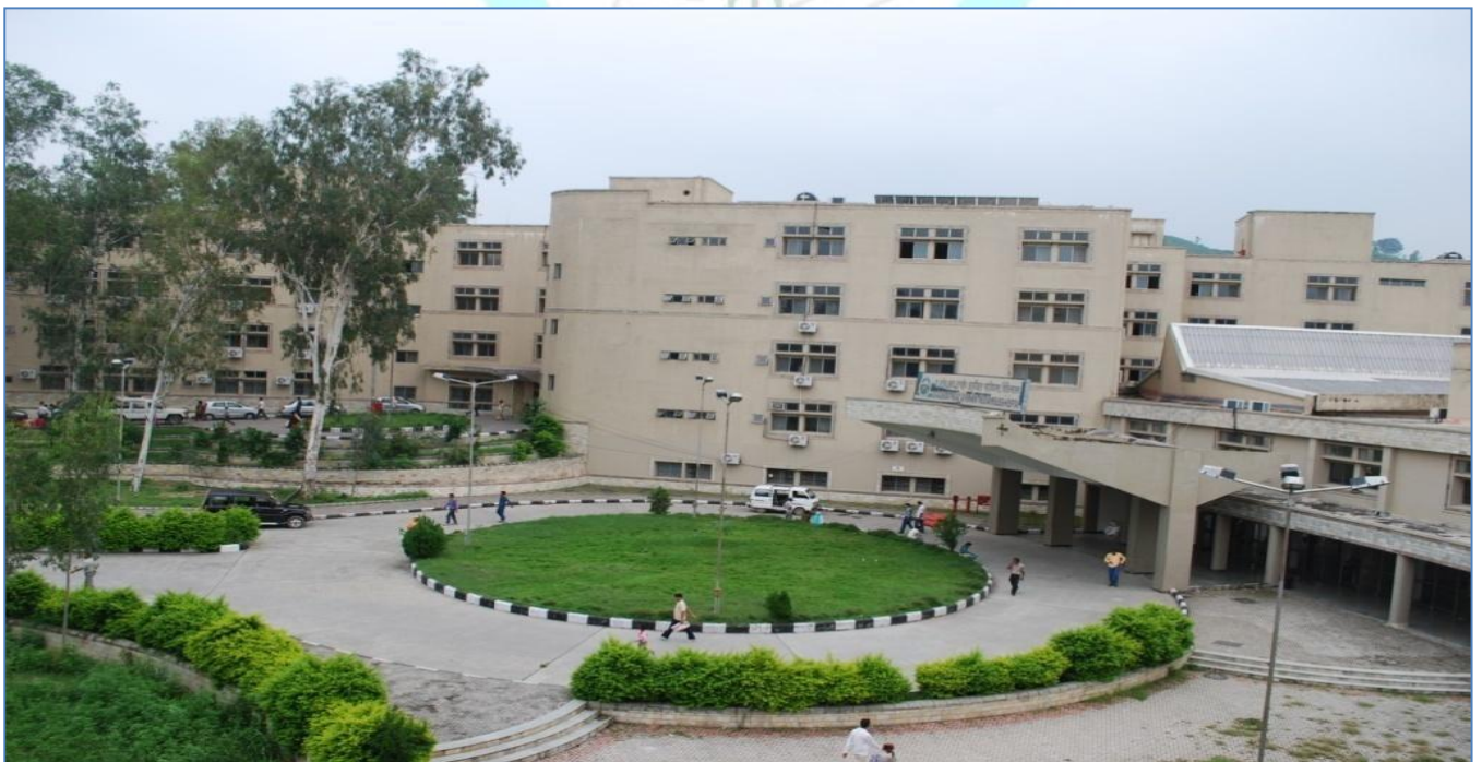
A VIEW OF Dr. R.P.G.M.C, TANDA AT KANGRA (H.P.)